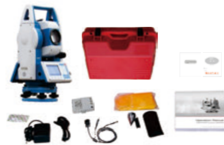
Mini Prism System ADSmini112A