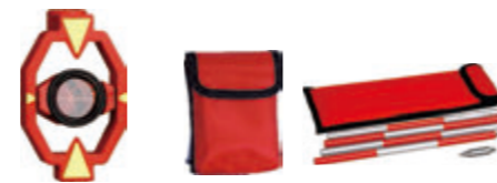
Dia.: 25.4mm Offset: -17.5/-7.5mm